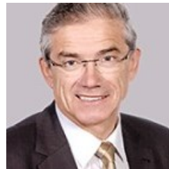
Eberhard Abele TU Darmstadt